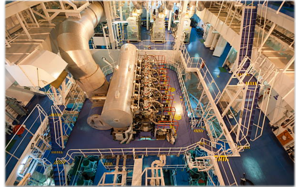
Engine Room Tour